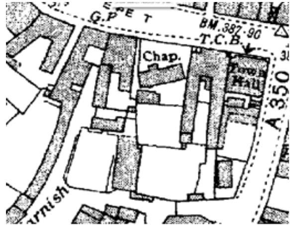
1924-1952 historic map