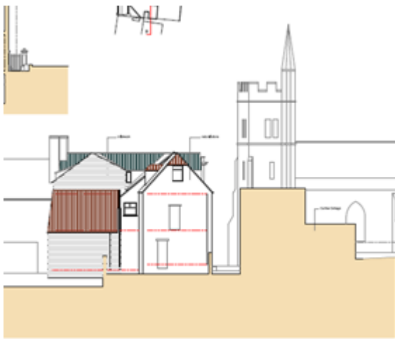
Existing (above left) and Proposed (above right) plans of South elevation and sections (Main Building)