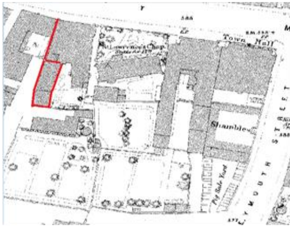
1868-1899 historic map of No. 3 High Street